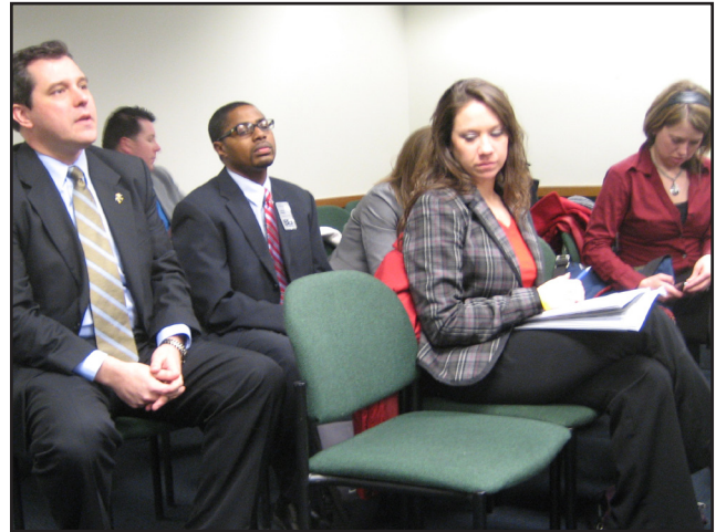
MOACAC members attend Legislative Day in Jefferson City.